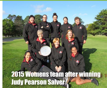
2015 Womens team after winning Judy Pearson Silver