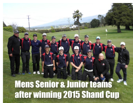
Mens Senior & Junior teams after winning 2015 Shand Cup